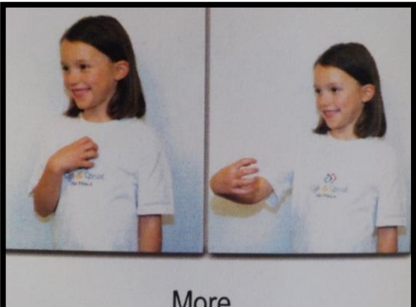
More move cupped hand forward from chest

Water move bent index finger down cheek, twice