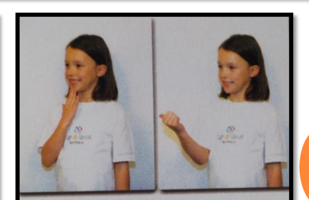
Please close hand to fist, leaving thumb out